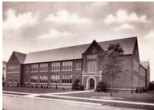
Canterbury School, Cleveland Heights, OH