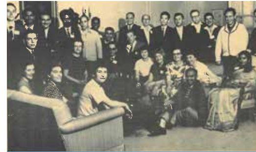
Training for a Changing World The Lake Forester (Chicago) May, 1962